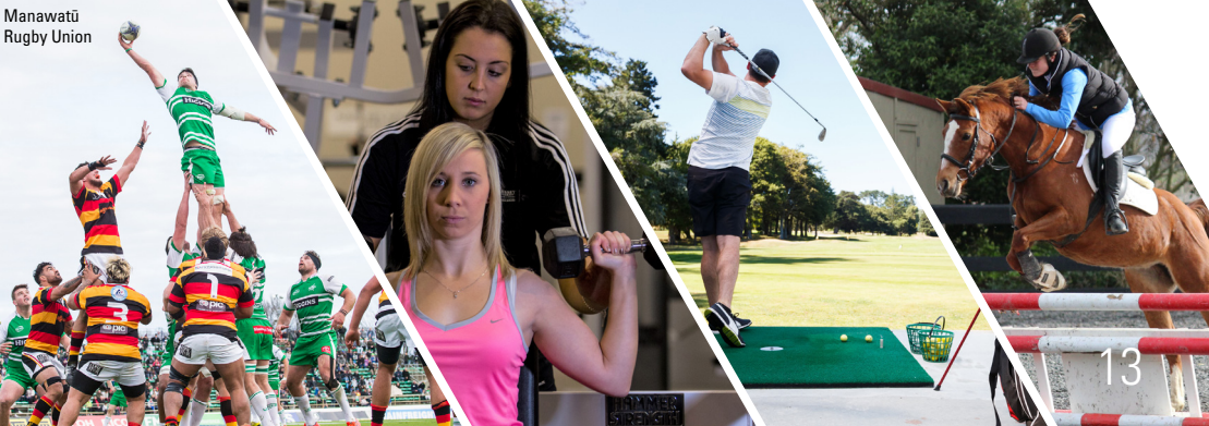
Manawātū Rugby Union