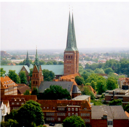
^ Eutin, Germany, a sister city of Lawrence, KS, has been a site for a Germanic language institute since 1966.

The Collins Scholarship fund will provide scholarships of approximately $10,000 per term to dedicated students for semester or academic year study abroad in Germany. It is the intent of the donors that these scholarships provide an opportunity for students to gain a thorough understanding of Germany, its people and culture. Because of