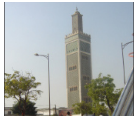
Grande Mosque, Dakar, Senegal

Undergraduate Freshman Scholarship, University of Kansas