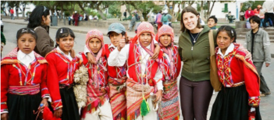
Latin America is becoming a popular study abroad destination, particularly at KU where the numbers grew significantly. Above, a KU study abroad participant enjoys visiting with children in Cuzco, Peru.