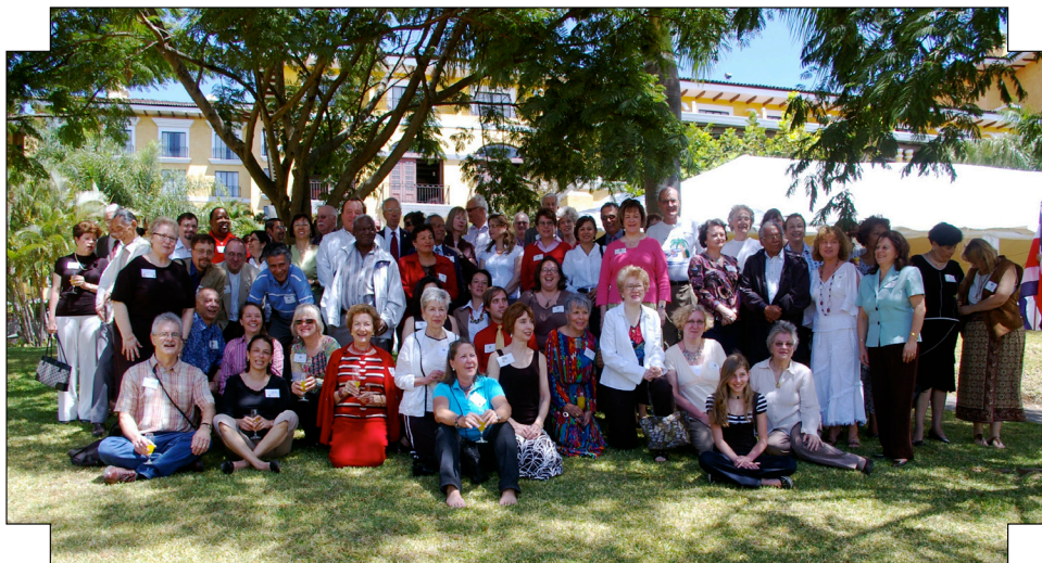
Gathering for a photo at the farewell brunch