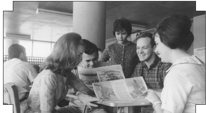
Grupo Students at UCR, 1962.